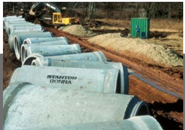
Concrete pipes do not require special protection on site.