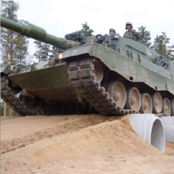
Concrete pipes can withstand even the most extreme loading situations.