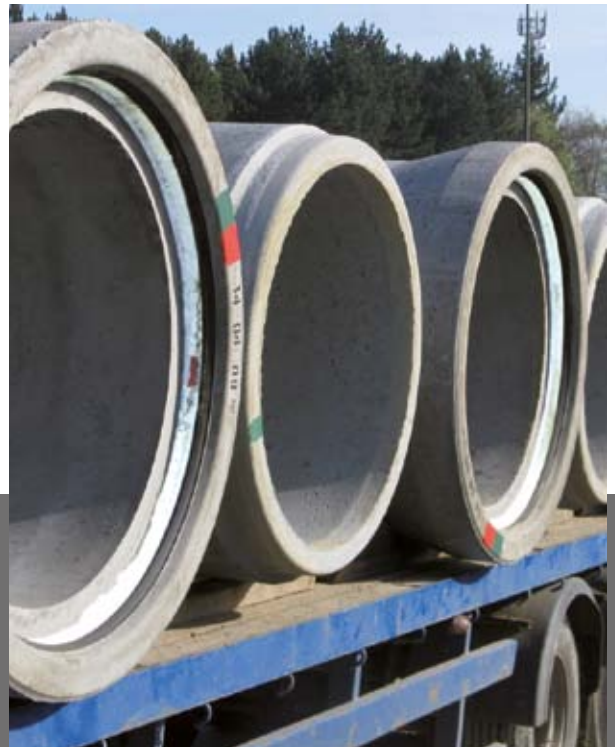
Integrally-cast sealing rings are part of the pipe socket.