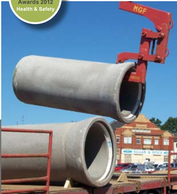
The Award-winning Pipe Lifter makes offloading fast, efficient and safe.

Water Industry Awards 2012 Health & Safety