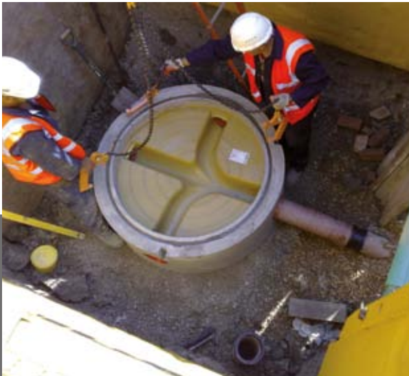
Precast manhole systems are watertight, safer to construct and save time and money to install.