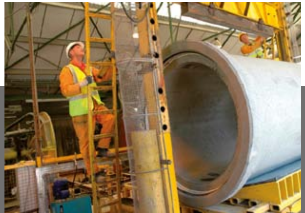
Testing a 1200mm pipe for strength.