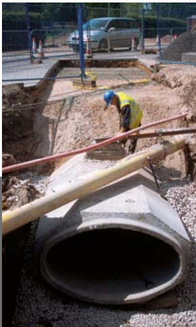
An elliptical pipe in a constrained area under a gas main and with minimal cover depth under a road.