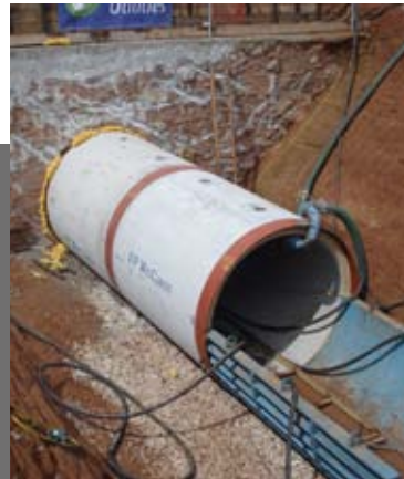
Pipe jacking is an excellent technology for reducing impact on the local environment as it leaves the ground undisturbed.