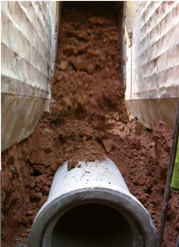
These pipes will stay put during installation and for years to come.