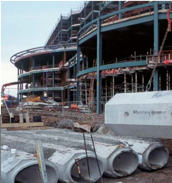
Elliptical tanks used for flood attenuation at Twickenham Rugby Stadium.