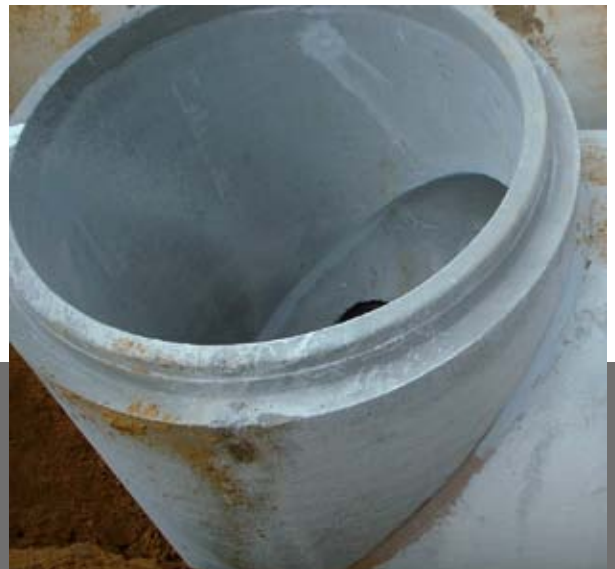
This large diameter concrete pipe is being used as a storm water attenuation tank. It has a specially made 90 degree bend to provide easy access for inspection and maintenance.